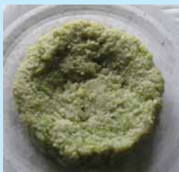
4. Dudhi Halwa - 2 Portions Calories - 690 Kcal; KD Ratio- 2.5:1