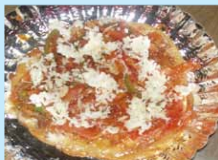
5. Pizza - 1 Portion Calories - 370 Kcal, KD Ratio- 2:1