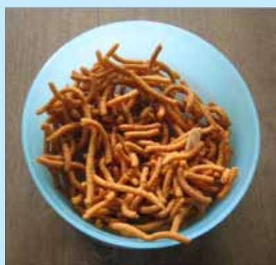
2. Sev - 2 Portions Calories - 690 Kcal; KD Ratio- 2.5:1