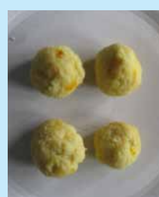
3. Pedas - 2 Portions Calories - 690Kcal; KD Ratio - 2.5:1