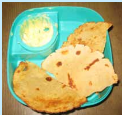
1. Khakra - 2 Portions Calories - 690 Kcal; KD Ratio- 2.5:1

We insist that patient check their urine 3-4 times a day, throughout the duration of the ketogenic diet.